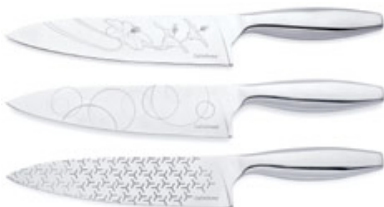
Rama Chorpash for CulinHome™, Décor Knife Collection: Hibiscus, Splash!, and JAX , 2006

This exhibition showcases the exceptional creativity of CCA alumni and faculty. Recent and contemporary works—including lighting, posters, furniture, housewares, and architectural models—demonstrate CCA's commitment to fostering cutting-edge design through a distinctive combination of concept and craft.